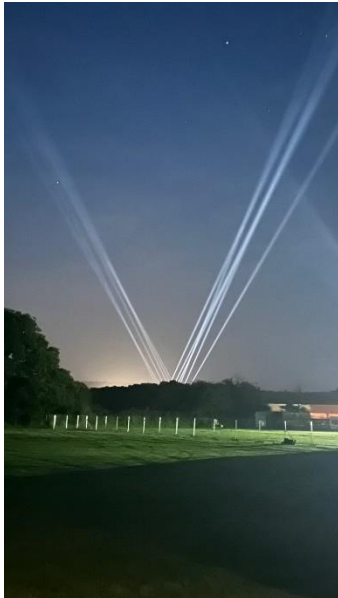
Lasers over Longleat

Saturday, a lovely warm fine evening...we congregated by the rally officer's awning with our tables, chairs etc., and were treated to a lovely evening supper of a Ploughman's with cheese (of course), ham, bread and much more including an alcoholic beverage. It was superb and greatly received by all. There was light music in the background and lots of lively chatter.