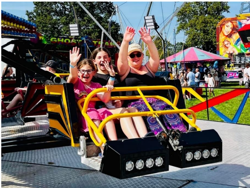
Ralliers enjoying the fun of the fair

Saturday arrived with beautiful blue skies and a temperature of about 28° to 30°! The Cheese show opened at 9am and people were queueing to get in. As soon as we walked in, I made a b-line for the cheese tent and wasn't disappointed with the copious quantities of yummy cheese samples to try and buy. We wandered around looking at Crafts, flower displays, and so much more. There were various displays of horsemanship, trial bike acrobatics and of course, the judging of the cows, sheep and goats. There should have been a dog agility display, but this was cancelled due to the heat.