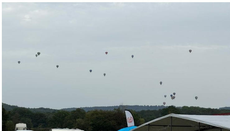
Balloon lift over Longleat

Sunday morning get together at the rally officers awning to enjoy doughnuts and a hot drink. There was a really good raffle and many of us won great prizes. Typically, it did splatter with a bit of rain at this point but didn't put us off, up went the brollies and we just continued on as true Brits do!