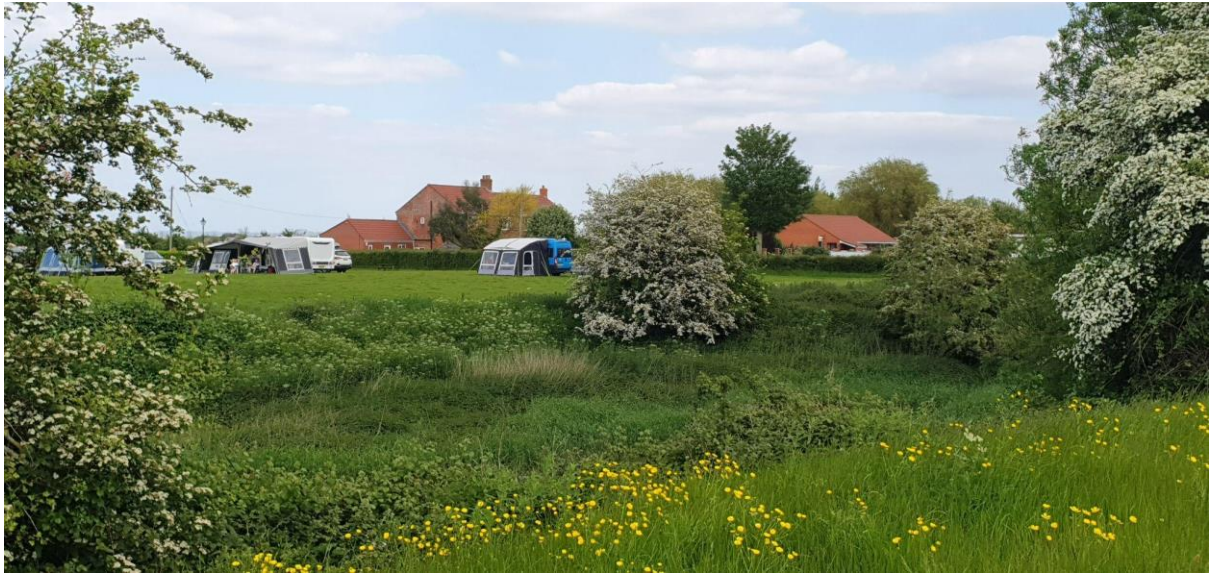
A view across the River Brue to the rally field

From the site, it's a very easy cycle ride into Highbridge and Burnham on Sea. On Friday, we optimistically set our sights a little further and cycled to Brean Down. The route goes along the beach, which in the sunshine was a beautiful if slow ride. Once there, we walked up, over, down and around the amazing site including the fort. Then we remembered we had to cycle 13 miles back again. Happily, there are very few hills, so the ride back was not as difficult as we'd feared - we opted for the roads for expediency. The other ralliers were finishing their fish and chips as we returned (we ate chips while we were out, so opted out of this activity).