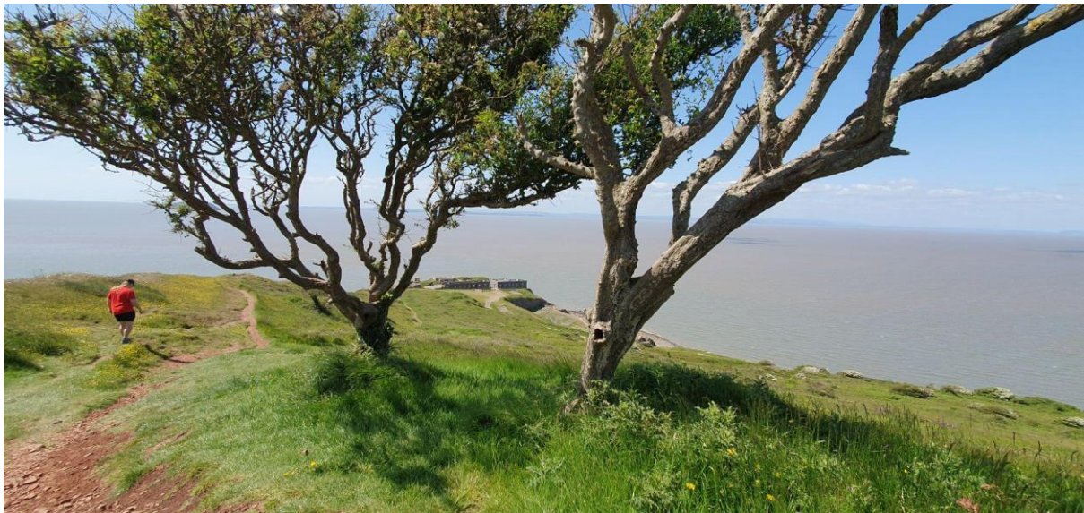
A view across Brean Down towards the fort

From the site, it's a very easy cycle ride into Highbridge and Burnham on Sea. On Friday, we optimistically set our sights a little further and cycled to Brean Down. The route goes along the beach, which in the sunshine was a beautiful if slow ride. Once there, we walked up, over, down and around the amazing site including the fort. Then we remembered we had to cycle 13 miles back again. Happily, there are very few hills, so the ride back was not as difficult as we'd feared - we opted for the roads for expediency. The other ralliers were finishing their fish and chips as we returned (we ate chips while we were out, so opted out of this activity).