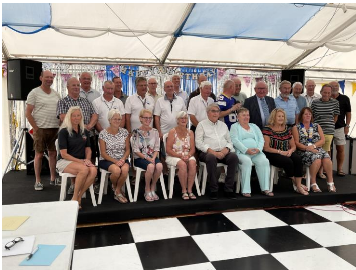
The Rally was attended by many Centre Chairmen and women both past and present. You will spot past