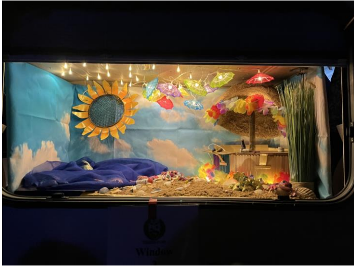
First: Emily Honor