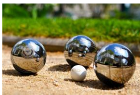
Bibury, Boules 8 th – 10 th July